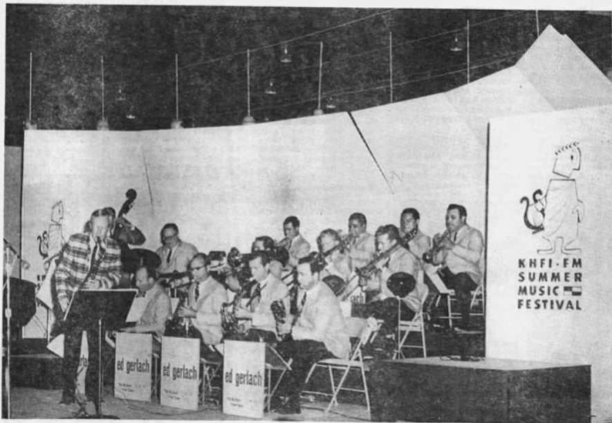
Austin, Texas, Sunday, July 9 1967