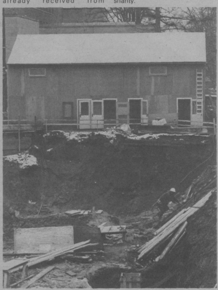
PLYWOOD MODERN — The ultimate in construction shanties has been built on the southwest corner of the construction site opposite Day Hall. Building will house office space and storage facilities for contractor and subcontractors.

"We built it," he said, "because there isn't enough room on the site for each contractor to park his own trailer shanty."