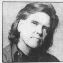
Guy Clark Bluebird Cafe

dren ages 7-17. For more information, call Ticketmaster at 737-4849. Another Nashville resident, singer/songwriter Janis Ian , plays her first hometown show since the release of her new album, Breaking Silence . Ian, still best known for her 1975 hit At Seventeen , has been reintroducing herself to music fans worldwide and winning critical acclamations in the process. She'll be joined by Joshua Kadison at