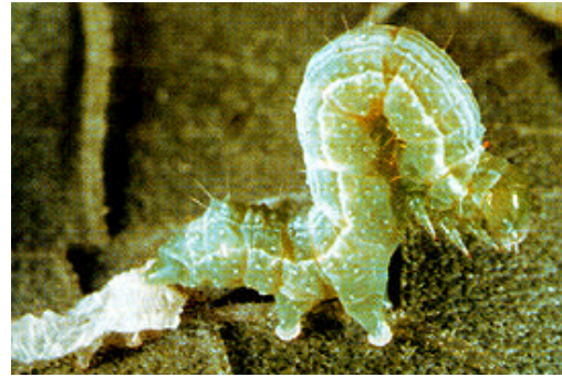
Alfalfa looper larva

A virus disease and several predators and parasites often reduce the looper population, but the population of natural enemies may not be sufficient to reduce heavy infestations. Insecticides may be used to prevent damage by this pest, but fields should be sampled prior to treatment to establish the need for