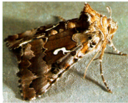
Alfalfa looper adult