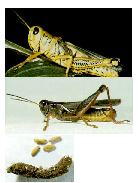
Adult grasshoppers and eggs from egg pod

These species overwinter as eggs in the soil. Eggs are laid in pods in the soil during late summer and fall and nymphs begin emerging in April, May, and June. Nymphs feed on vegetation for 40 to 60 days before molting into adults. Adults disperse to suitable hosts during the summer and can do serious damage to crops. Adults mate in late summer and lay overwintering eggs. Some species have well-defined breeding and egg laying areas. In most areas, eggs are laid in waste areas, along roadsides, and around field margins. For example, an egg bed of the clearwinged grasshopper may contain as many as 3,000 to 100,000 eggs.