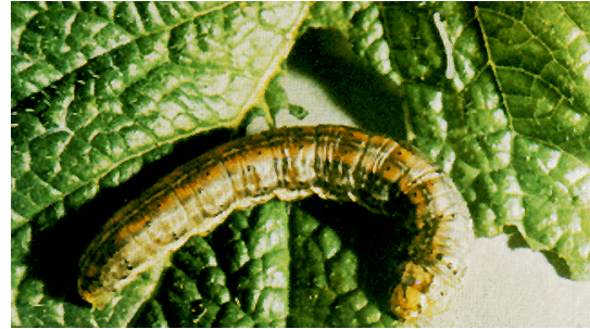
Redbacked cutworm larva

Control of redbacked cutworm and other Euxoa species is very difficult because of the subterranean habits of the larvae. Larvae are easiest to control when they are small and fields should be checked regularly to detect the presence of young larvae. The larval population can be estimated by taking soil samples around the bases of host plants or weeds in