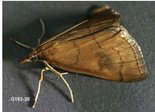
Mint root borer adult.