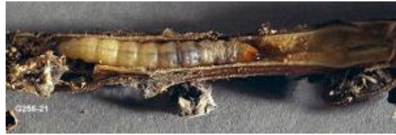
Mint root borer mature larva.

Inspect fields during the growing season when adults are active. A sex pheromone is available to monitor adult emergence. Place at least two pheromone traps in the field and count the number of adult males captured each week. No threshold has been set for pheromone trap catches, but they may serve as indicators of potential infestations and may be used