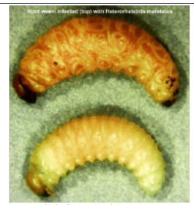
Root weevil infected with nematodes (top)

Entomopathogenic nematodes have several important attributes that make them excellent candidates for biological control of soil insects. 1) they are specialized to carry and introduce symbiotic bacteria into the insect hemocoel, 2) most have a broad host range that includes the majority of insect orders and families, 3) several species can be cultured artificially on a large scale, which makes it possible to commercially produce large quantities, and 4) they have limited impact on nontarget organisms and are not disruptive to the environment. Numerous insect pests on many different crops are controlled by parasitic nematodes. Insect hosts include