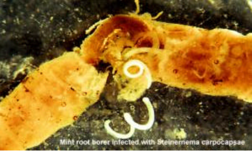
Mint root borer infected with nematodes