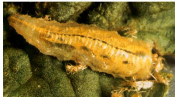
Syrphid fly larva

Syrphid flies overwinter as pupae in the soil. Adults begin emerging in April and May about the same time as aphid populations begin to increase. They lay eggs on leaves and stems of plants infested with aphids or other suitable prey. Eggs hatch in 3 to 4 days into soft-bodied maggot-like larvae. Larvae feed for 7 to 10 days, then drop to the soil to pupate. A life cycle from egg to adult is completed in 16 to 28 days and there are three to seven overlapping generations each year.