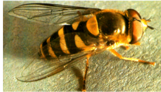
Syrphid fly adult

Adults are 10 to 12 mm long marked with yellow, black, or white bands resembling bees or small yellowjackets. They fly swiftly and tend to hover over plants (also call hover or flower flies). Adults feed only on pollen, nectar, or honeydew produced by aphids. Larvae are about 12 mm long, wrinkled or slug-like, and tapered to a point anteriorly. They are usually brown or green with whitish areas. Eggs are chalky-white with faint longitudinal ridges and are laid singly among aphid colonies.